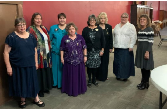
Indiana Job's Daughters Face- book

Past Job's Daughters at District 8 OES Reception in Terra Haute on No- vember 13.