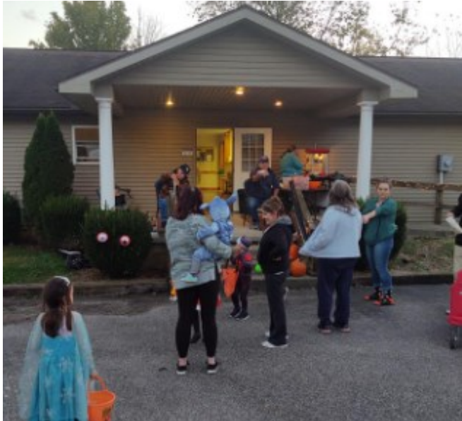
Milltown Lodge #661 Facebook

Members of Milltown Lodge handed out treats to kids on Halloween.