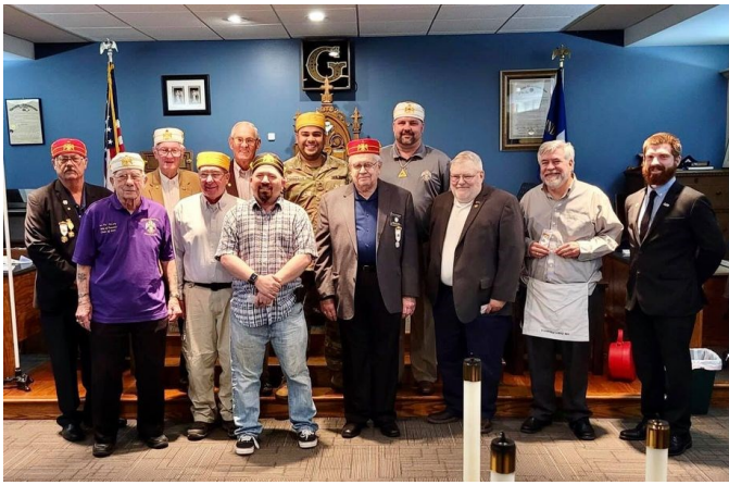
Scottish Rite Valley of Evansville Facebook

Scottish Rite Valley of Evansville honors their Veterans at their meeting on November 2.