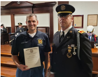
Prather York Rite Facebook

Congratulation to the Sir Knights of Prather Command-ery #62 on the 100% participation of donations to the Knights Templar Eye Foundation. On November 1, several Sir Knights were pre-sented with Indiana Templar Academy Certificates.