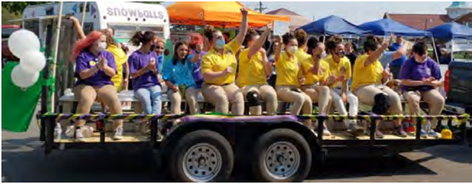
Indiana IORG Face- book