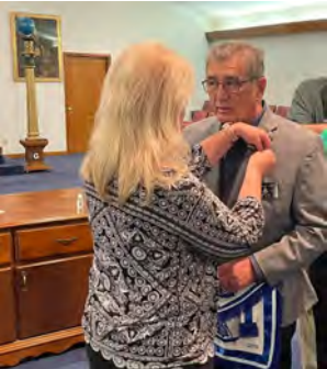
Greenwood Lodge 514 Facebook