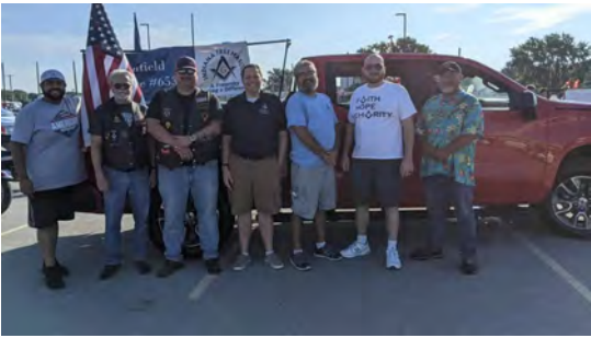
Plainfield Lodge & ap- pendant Bod- ies Facebook

Plainfield lodge sponsored and participated in the Quaker Day Parade on Saturday, September 18.