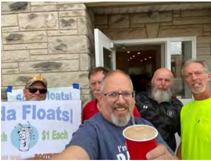
Beech Grove Lodge #694, F&AM Facebook

When Beech Grove holds their Fall Festival, the members of Lodge #694 serves famous Root beer or Orange Soda Floats.