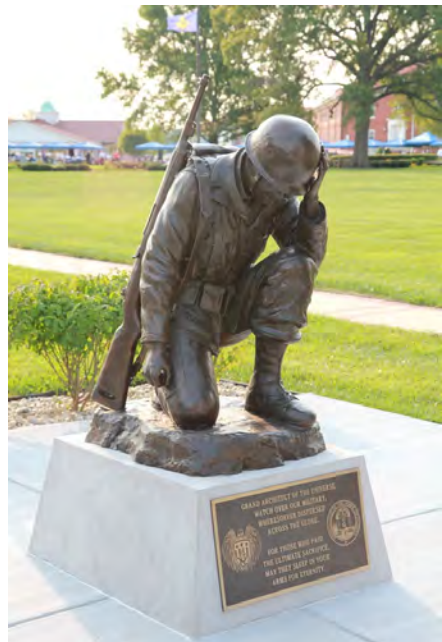
^The newly dedicated Veteran's Memorial on the west side of the circle.