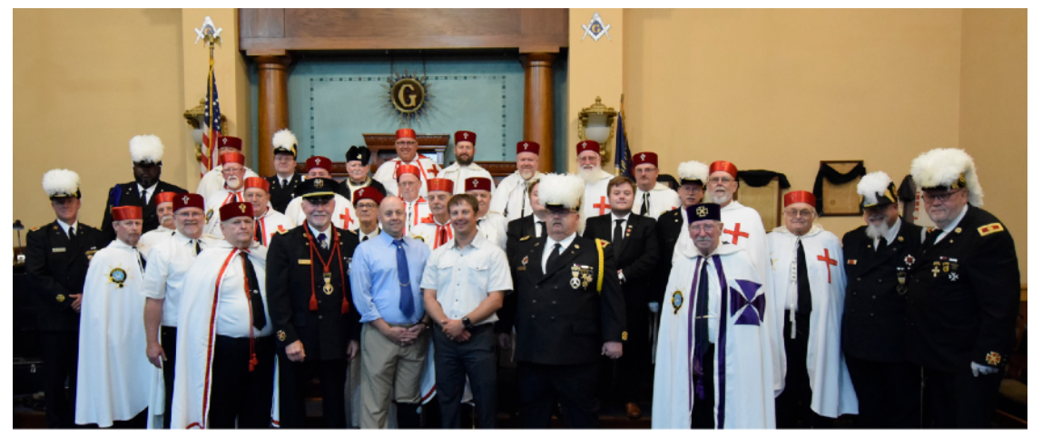
The Inspection on the Order of the Temple followed the Reception. Two candidates were newly Knighted during the Order.