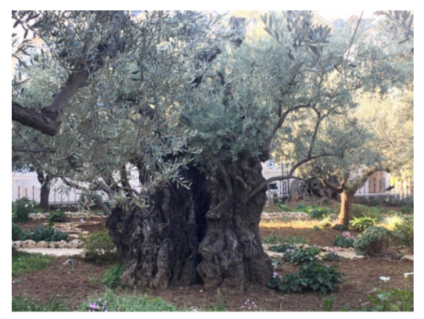
Page 13 of 21