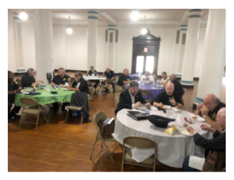
ITA in Northern IN Ft. Wayne