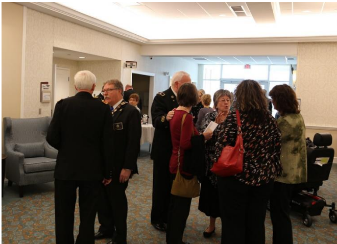
A few of those attending sharing memories.