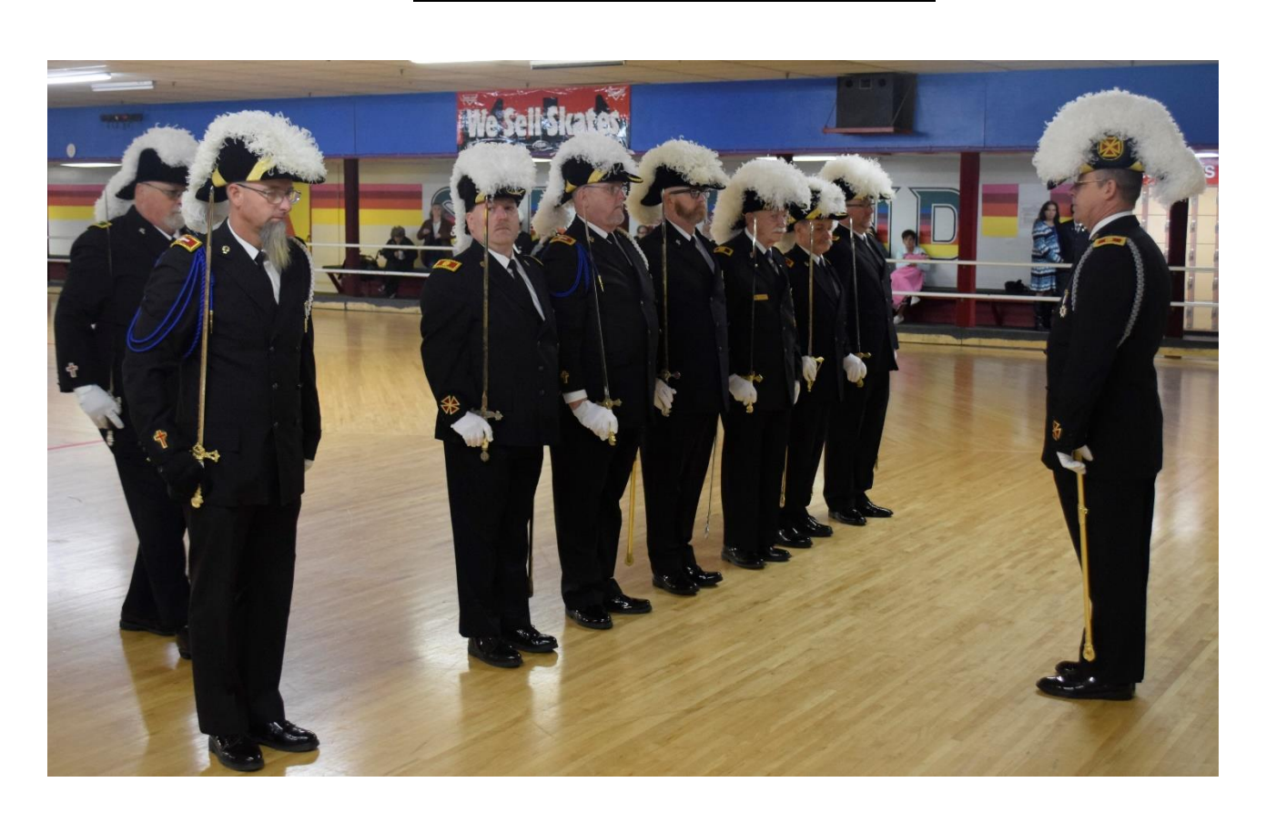
Baldwin Commandery No. 2 Personal Inspection before the Drill