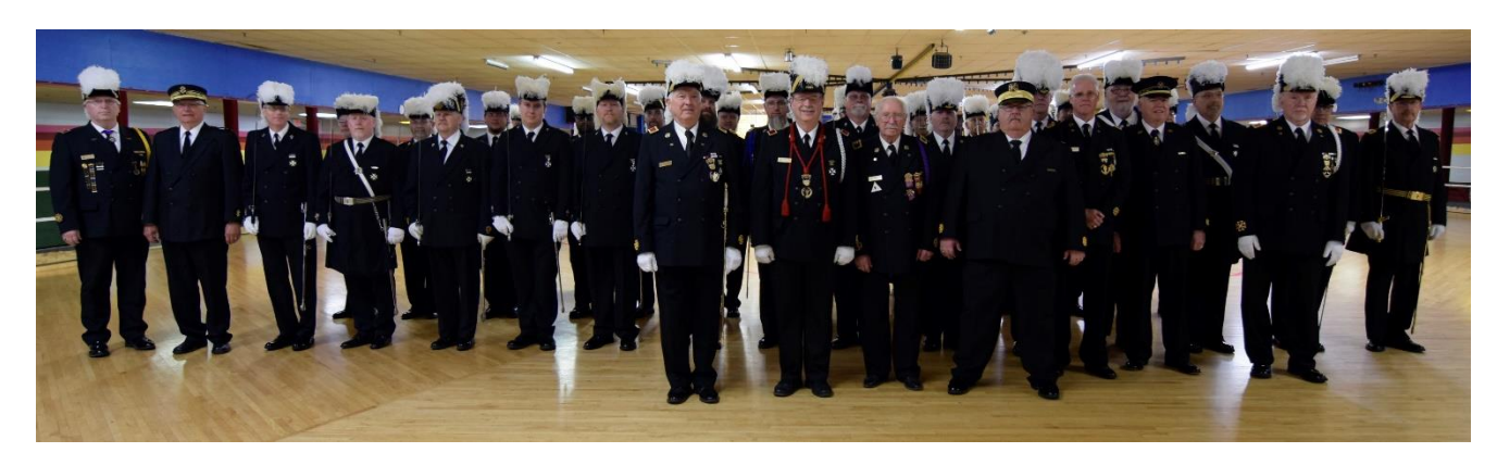
Drill Teams, Inspecting Officers and Grand Officers April 21, 2018