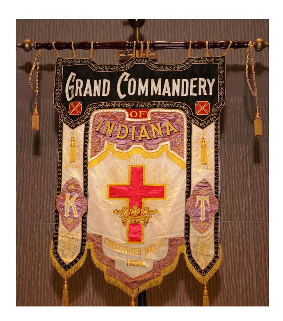
Grand Standard of the Grand Commandery