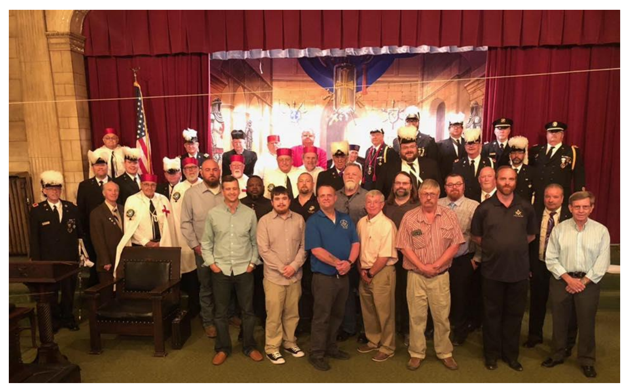
9/29/2018 Evansville Commandery One Day Class: Pictured are member of the conferral teams for the Orders, 3 Grand Commandery Officers and the 15 new Sir Knights.