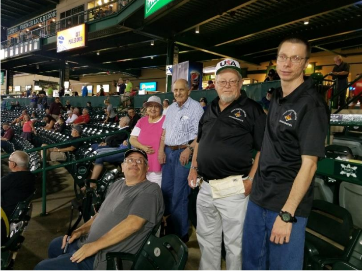
Grant County York Rite

Eleven members, friends and family enjoyed an evening with the TinCaps in Fort Wayne.