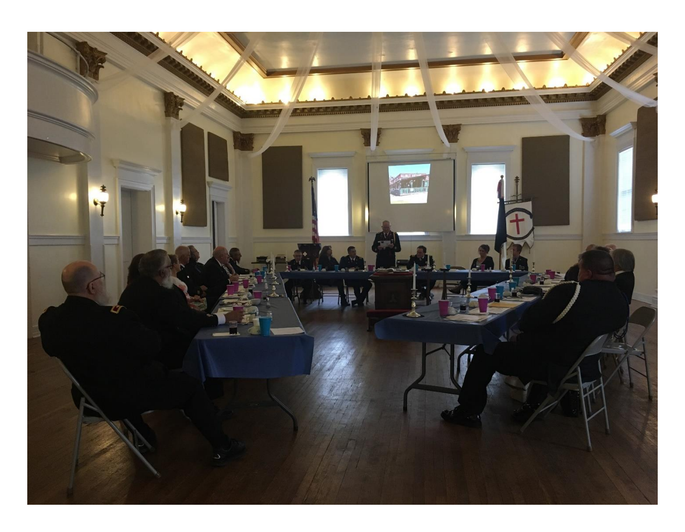
9/22/2018 Grand Commander's Reception and Templar Board at Crawfordsville for Battalion No. 4.

Eleven members, friends and family enjoyed an evening with the TinCaps in Fort Wayne.