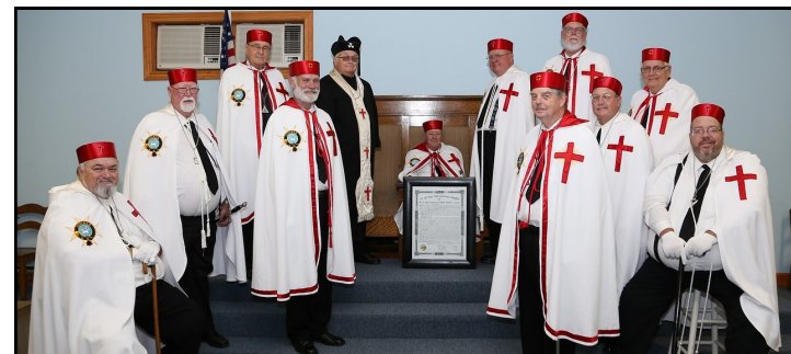
LINTON — The newly installed officers of Greene County Commandery No. 68 are ready to go to work.

"Once again, I want to welcome and congratulate Greene County Commandery No. 68 on becoming the newest Commandery of Knights Templar in Indiana."