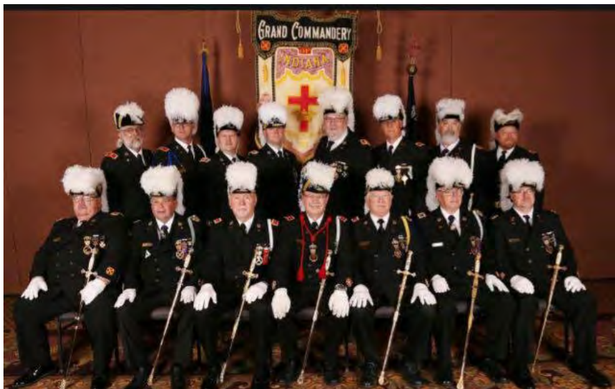
The officers of the Grand Commandery of Indiana for 2017-18