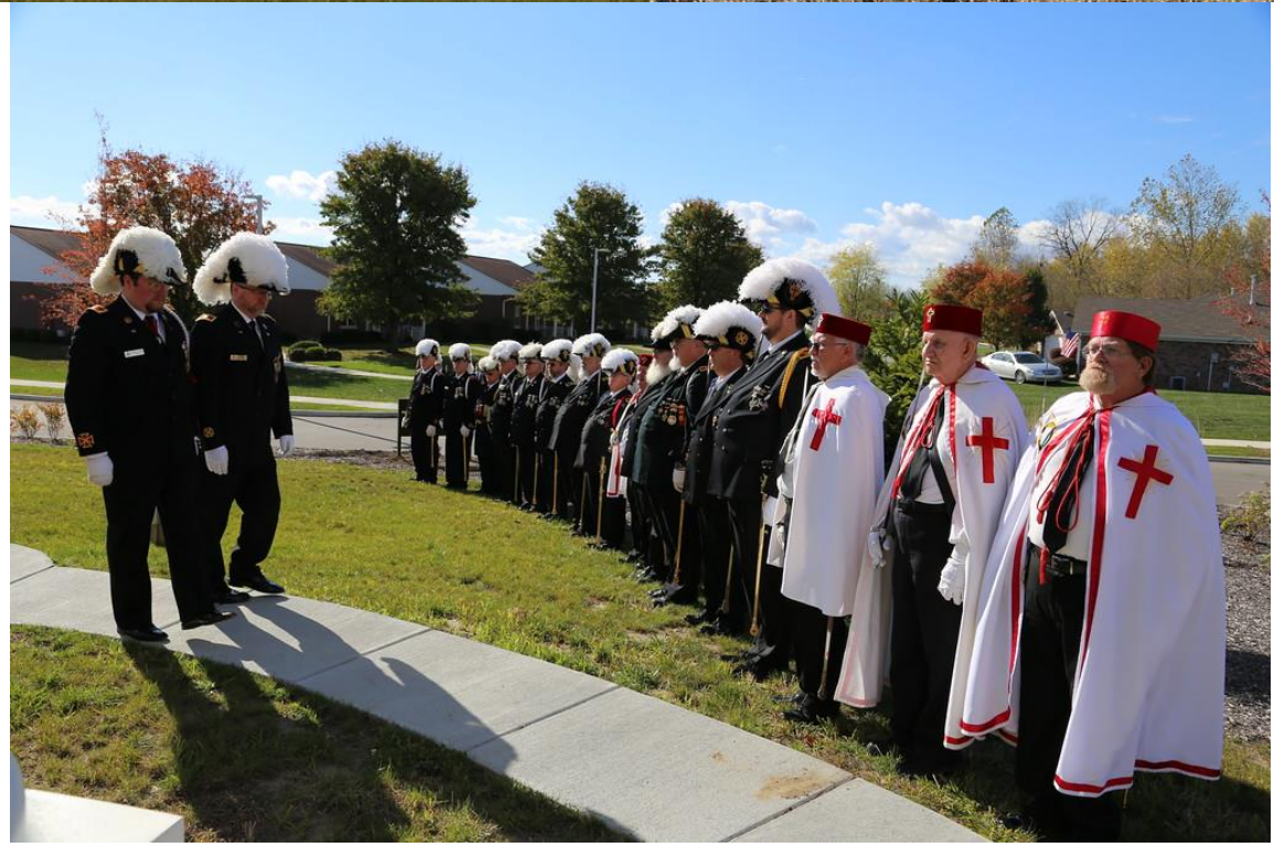
Page 4 of 15