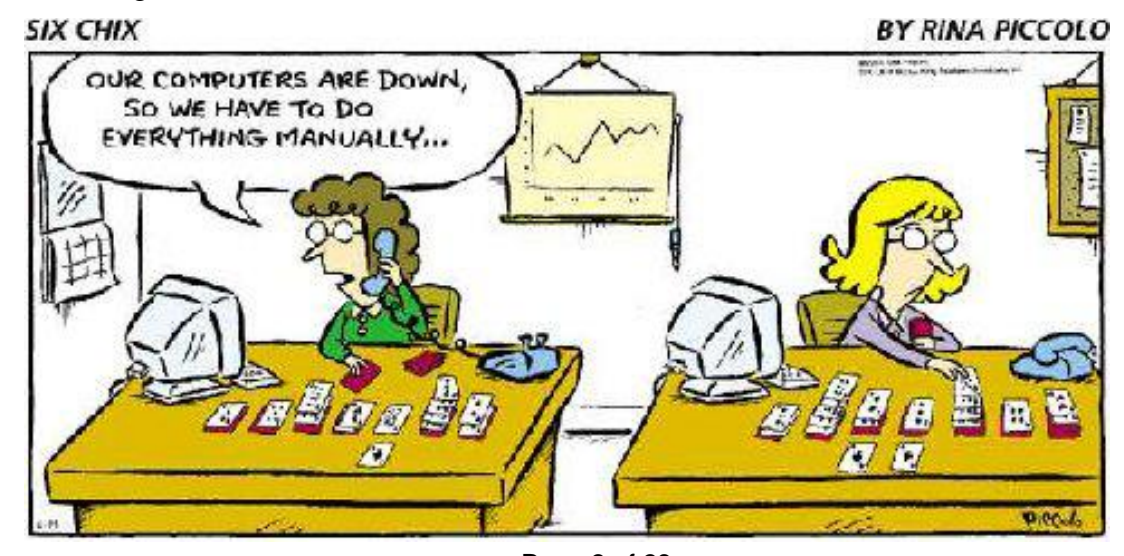
Page 2 of 23