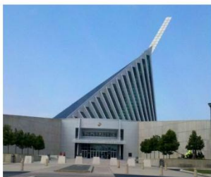
MUSEUM OF THE MARINE CORPS

ITINERARY TIMES AND STOPS ARE APPROX. & SUBJECT TO CHANGE.