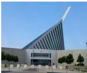
MUSEUM OF THE MARINE CORPS

ITINERARY TIMES AND STOPS ARE APPROX. & SUBJECT TO CHANGE.