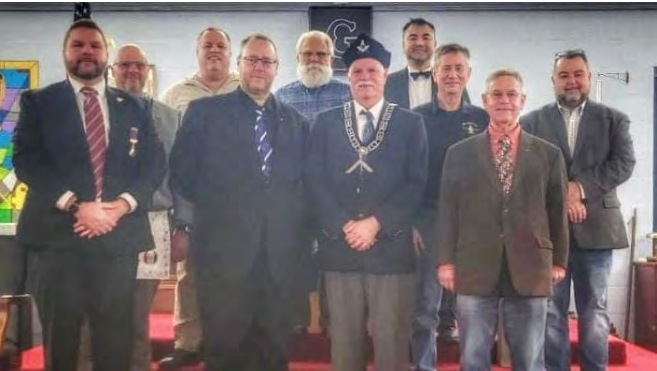
Carmel Lodge 421 Facebook