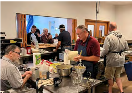
Oakland Lodge 140 F&AM Facebook

On October 7, members of Oakland Lodge gathered in the kitchen bright and early that morning as they got ready to serve breakfast.