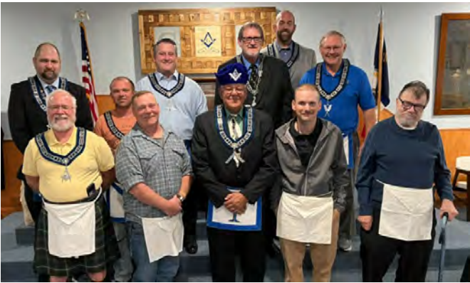
Oakland Lodge 140 F&AM

Congratulations to Oakland Lodge’s newest Fellow Craft member!