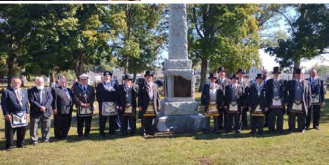
Evansville Lodge No 64, F & A M Facebook