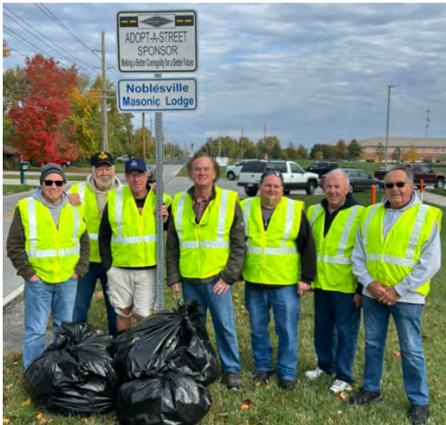
Noblesville Lodge F&AM #57—Indiana Freemasons (Noblesville Lodge #57) Facebook