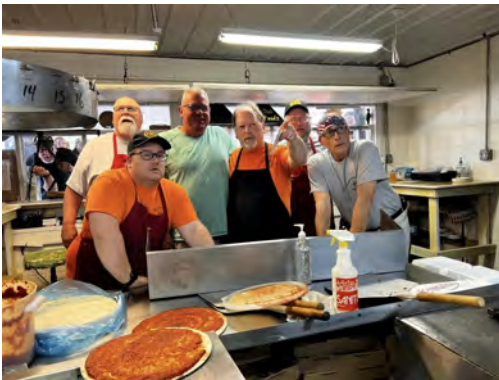
Shelby County York Rite Facebook