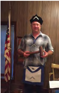
Branchville Masonic Lodge Facebook

On May 26, The Companions of Clinton Chapter No. 82 exalted three new Royal Arch Masons. Congratulations to the new Companions. It was a great night for Capitular Masonry!