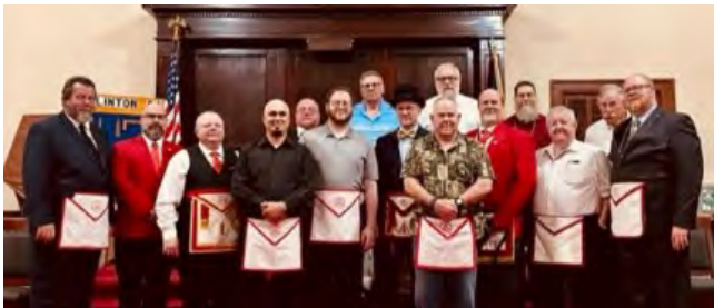
Grand Chapter of Royal Arch Masons of the State of Indiana Facebook

On May 26, The Companions of Clinton Chapter No. 82 exalted three new Royal Arch Masons. Congratulations to the new Companions. It was a great night for Capitular Masonry!