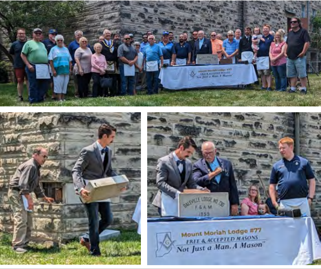
Mount Moriah No. 77, F.&A.M. Facebook

On June 10, Grand Commandery held their summer meeting at the Shelby Lodge. They had an educational meeting and shared a lot of ideas.