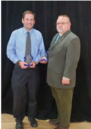
West Newton DeMolay Facebook