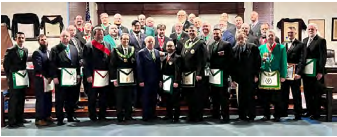
Prather York Rite Facebook

On June 17, AMD held their third annual ingathering of Indiana AMD's at Prather Lodge.