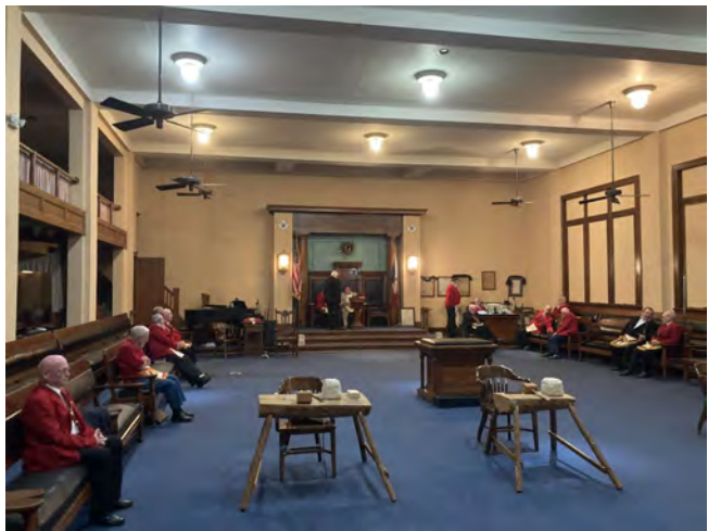
Dubois County York Rite Facebook