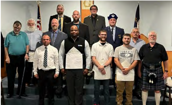
Oakland Lodge 140 F&AM Facebook

A total of eight new members joined Indiana Priory #8 on May 13 in Ft. Wayne. They also held their meeting and installed this year's officers.