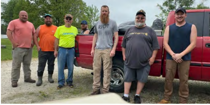
Linton Masonic Lodge #560 Facebook

On May 18, Oakland Lodge initiated three new Brothers. They had a great cast that made it a special night.