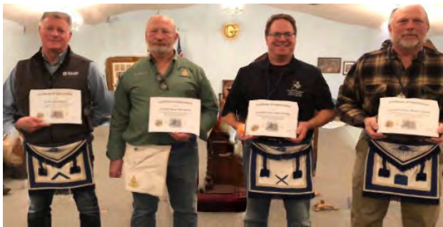
Masonic Heritage Foundation, Inc DBA: Schofield House Facebook

On March 21, brothers and ladies of Aurora Masonic Lodge #51 were presented with Certificates of Appreciation for their support during the Schofield House's Nights Before Christmas candlelight tour.