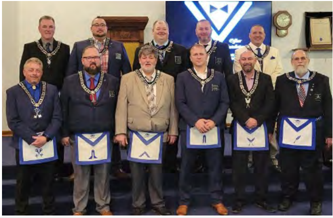
Greenwood Lodge 514 Facebook

On December 16, the 2023 Officers for Noblesville Lodge were installed in their stations. Congratulations to all the new officers!