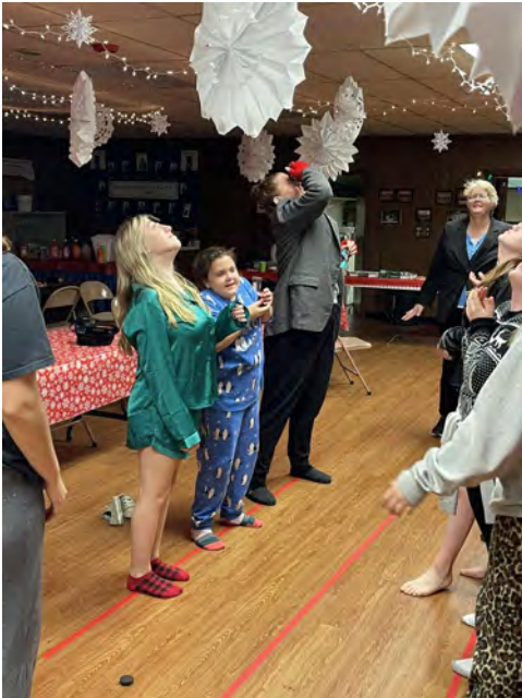
Job's Daughters. Bethel #24— Sellersburg, IN Facebook

On December 3, girls from Bethel #24 shopped for a girl from the Salvation Army Angel Tree then delivered the gifts to her. Afterwards the went to lunch and a movie followed by a visit to Bethel #18 in Louisville, KY for games and a sleepover.