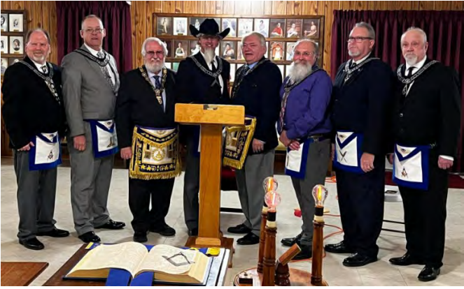
Farmers Lodge No. 147, F. & A. M., Indiana Facebook