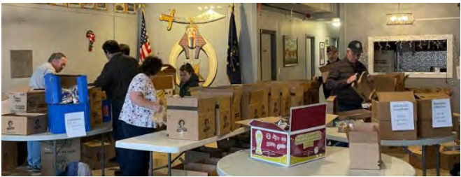
Battle Ground Lodge No. 313 Facebook