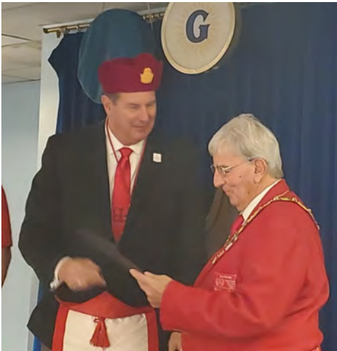
Grand Chapter of Royal Arch Masons of the State of Indiana Facebook