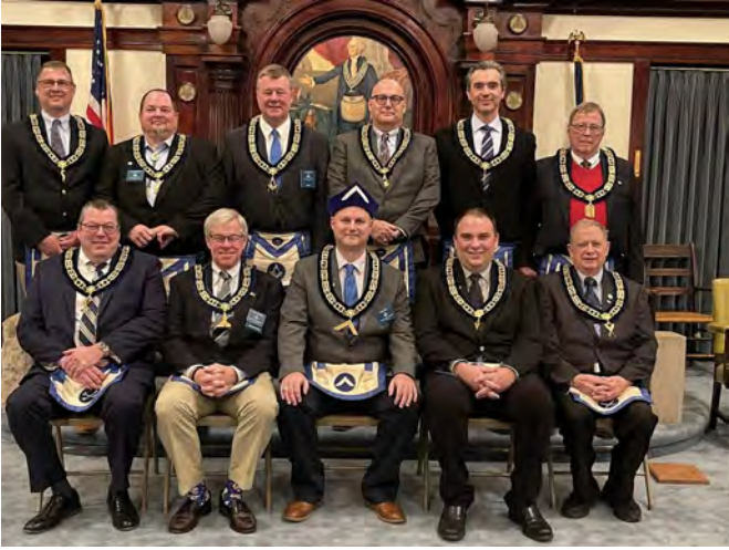
Noblesville Lodge F&AM #57 Facebook

On December 10, the Rainbow Girls were able to re-turn to the Masonic Home—Compass Park after 2 years.