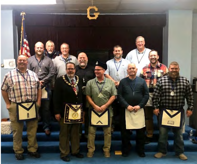
Russiaville Lodge Facebook

The 2023 Officers of Chapter #55 and Council Officer #28 were Installed on December 6.