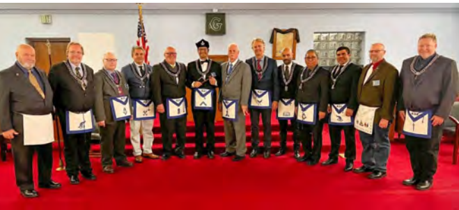
Carmel Lodge 421 Facebook

The 2023 Officers of Carmel Lodge are looking forward to another year of continued growth.