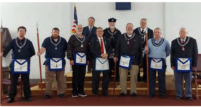
Brookside Lodge #720 Facebook

Brookside Lodge of Indianapolis has installed their 2023 Officers.