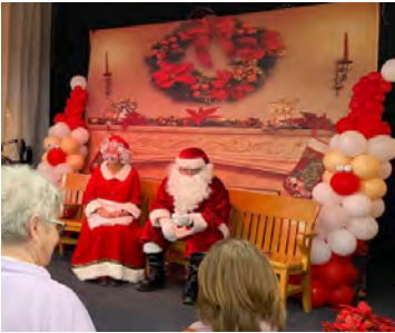
Women's Auxiliary of the Sahara Grotto Facebook

On December 17, Sahara Grotto held their kids Christmas Party, which was a huge success!