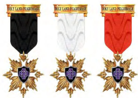
HOLYLAND PILGRIMAGE BARS

In order to promote certain advantages for the welfare of the Grand Commandery in general, the Constituent Commanderies and Sir Knights in particular, there is hereby submitted to this Grand Commandery Conclave a proposal to establish a "HOLY LAND PILGRIMAGE JEWEL" for the Grand Commandery of Indiana. (A) The Jewel should be presented only in consideration of loyal and financial support to the Holy Land Pilgrimage program. There is three level of support 1) $250.00 2) $500.00 3) $1000.00. For a donation of two hundred and fifty dollars the donor shall receive a jewel with a black ribbon. For a donation of five hundred dollars the donor shall receive a jewel with a white ribbon. For a donation of one thousand dollars or more the donor shall receive a jewel with a red ribbon. The donation will be accumulative totals. In lieu of jewel the donor may wear the bar. See below