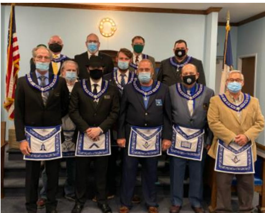
Beech Grove Lodge #694