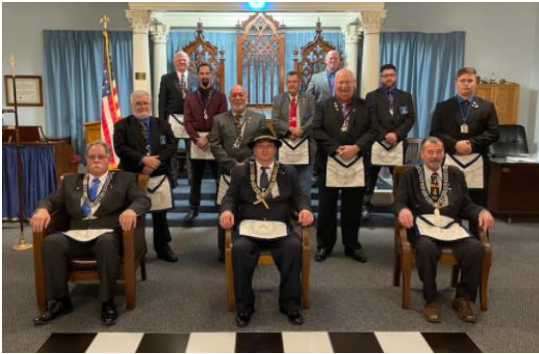
Plymouth-Kilwinning Lodge #149

Officers for 2021 were installed on December 12th.