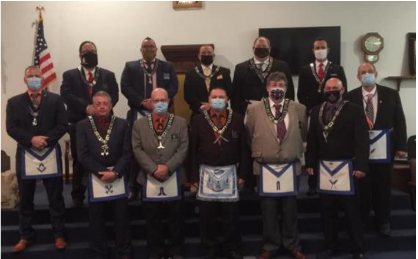
Greenwood Lodge #514

Greenwood Masonic Lodge #514 conducted its 146th annual Officer Installation on December 10.