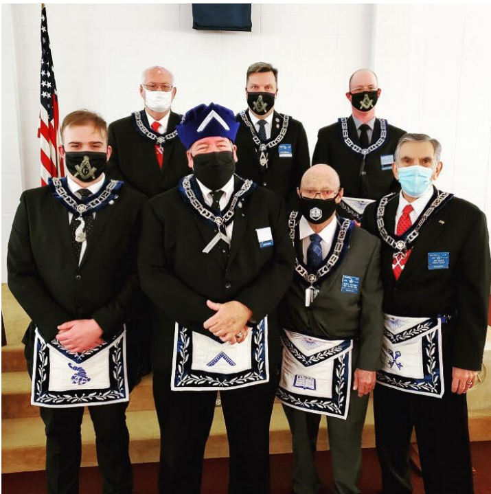
Englewood Lodge #715