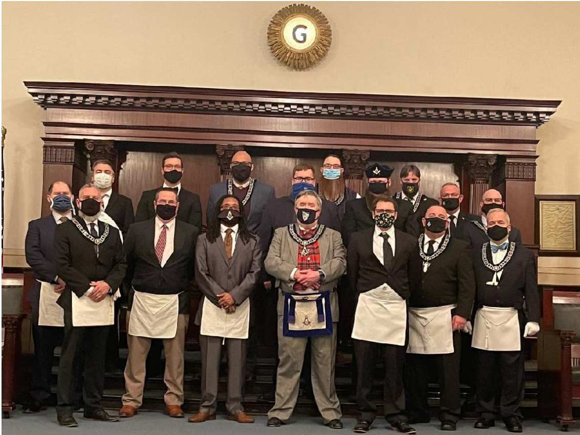
Pentalpha Lodge #564

We had a wonderful Enter Apprentice Degree on December 5th at Pentalpha Lodge #564. Congratulations to the two new brothers!!