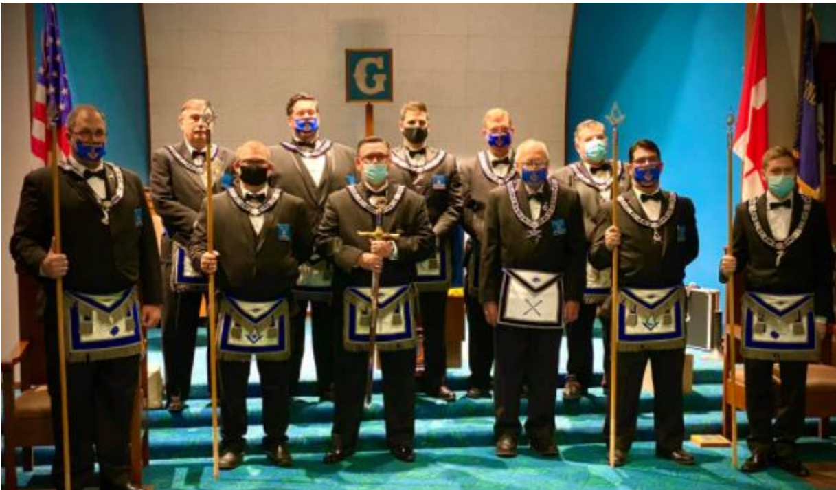
Porter Lodge #137