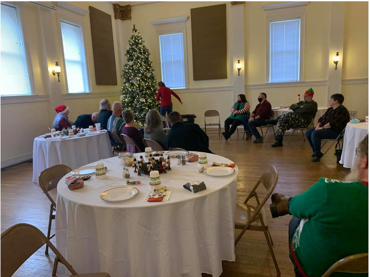
Grand Commandery Christmas Party 2020