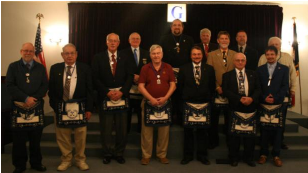
Austin Lodge #128

Congratulations to all the Officers of Austin Lodge No. 128.