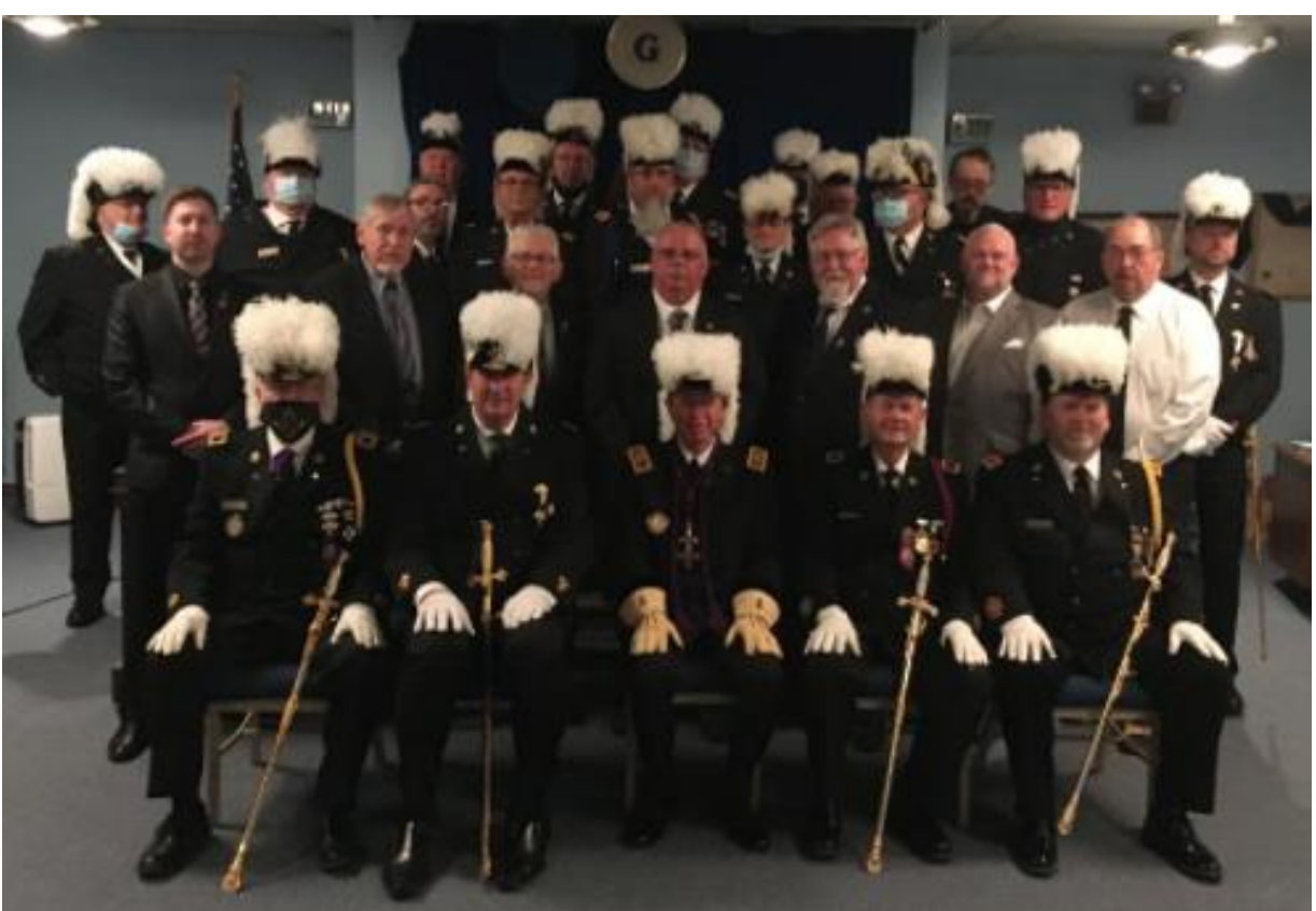
Order of the Temple

On Tuesday, March 16<sup>th</sup>, Grant County conferred the Order of the Temple.