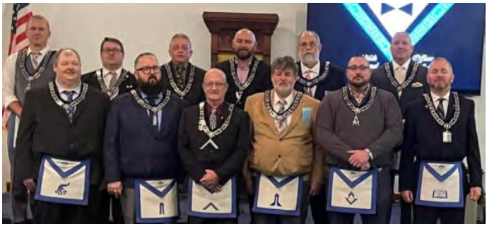
Greenwood Lodge 514 Facebook

Welcome the 2022 Officers of Greenwood Lodge #514.