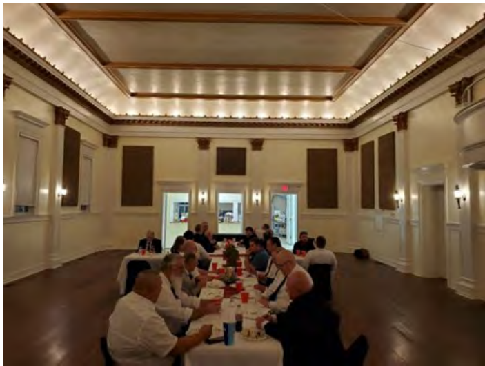
Dinner provided by the Social Order of the Beauceant. Order of the Temple 12/17/21