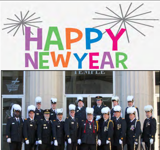
From and to the Officers and Sir Knights of the Grand Commandery Knights Templar of the State of Indiana