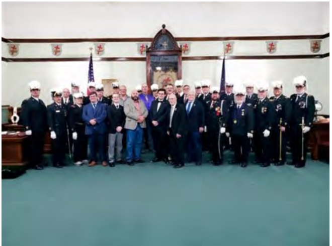
Dinner provided by the Social Order of the Beauceant. Order of the Temple 12/17/21