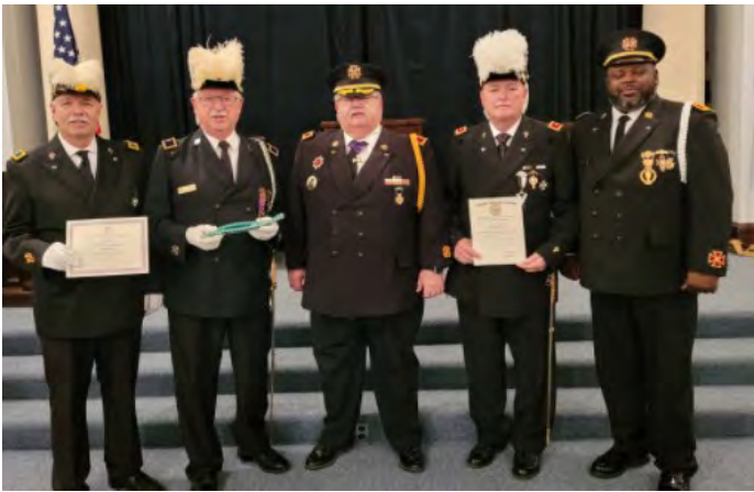
Angola York Rite Facebook

On December 16, Greenfield York Rite had Installation of Officers for 2022 tonight and then celebrated the Christmas Season at Costa’s Grill.