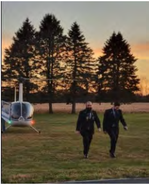
Mount Moriah No. 77, F&AM

On December 2, the Worshipful Master Elect and the Worshipful Master made quite the en- trance for the Actual Past Master De- gree.