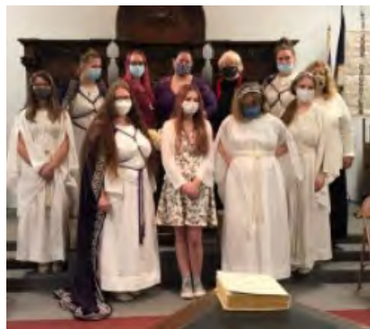
On December 13, Jobs Daughters Bethels #121 and #2 had their Official Visit.