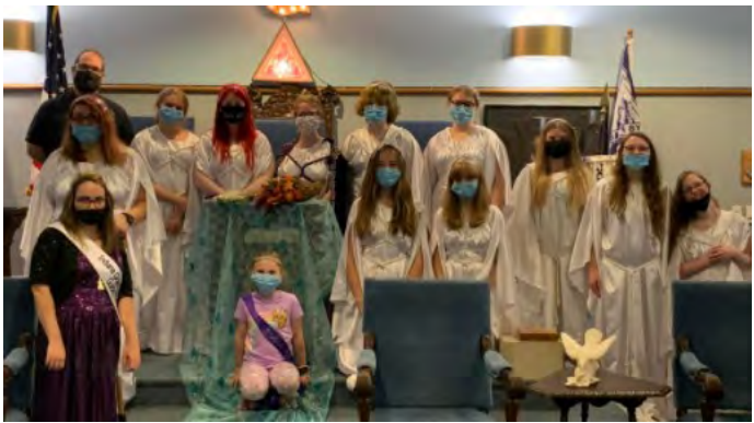
Bloomington Job’s Daughters Bethel #22 Facebook

Welcome the 2022 Officers of Greenwood Lodge #514.