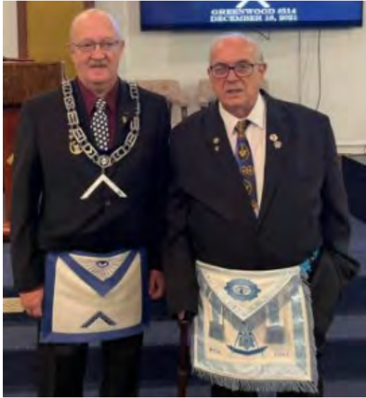
Greenwood Lodge 514 Facebook