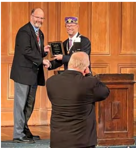
Speedway DeMolay Facebook