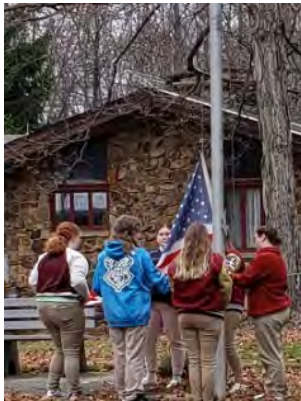
Indiana IORG Facebook

The Indiana Rainbow Girls had a great weekend at their lodge. They had their Grand Cross on Saturday and the Grand Helpers Holiday Party on Sunday.