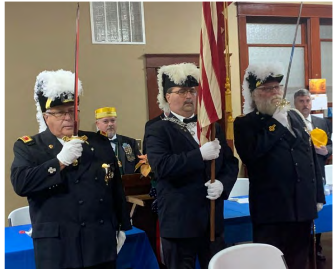
Grand Commandery Knights Templar of Indiana Facebook

On November 12, the Sir Knights of New Albany Commandery #5 presented the Colors at the Veterans Dinner for the Scottish Rite Valley of George Rogers Clark.