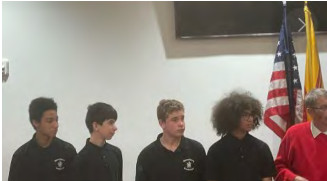
Speedway DeMolay Facebook

On November 12, Speedway DeMolay assisted the Indianapolis Scottish Society's annual St. Andrew's dinner at the Murat. The young men were recognized for their hard work.