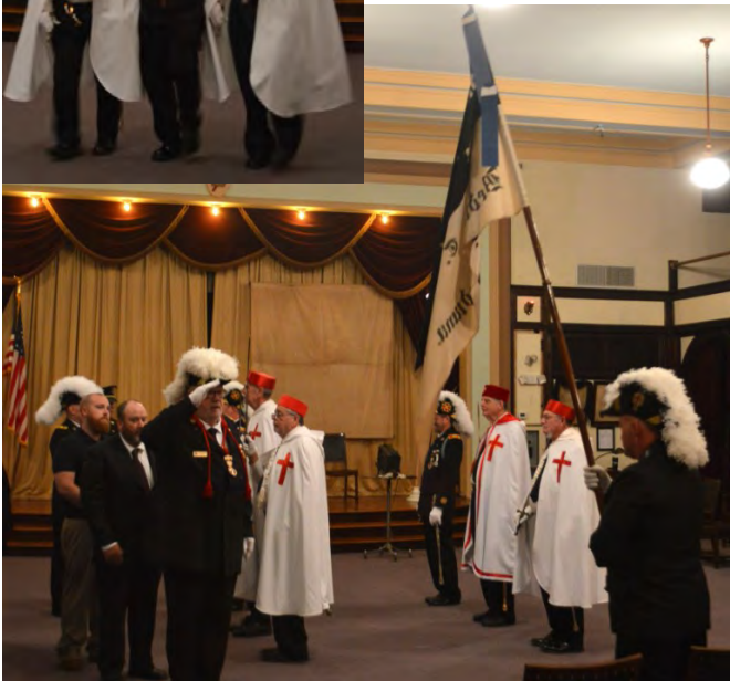
Grand Commandery Knights Templar Facebook

On a cold and windy Saturday morning, Bedford Commandery #42 and Bloomington Commandery #63 welcomed Sir Knights and their Ladies to their joint Inspection/Reception.