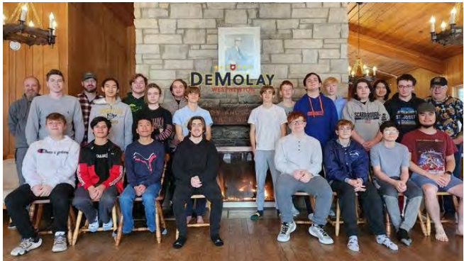
West Newton DeMolay Facebook

It was a little snowy at the Indiana DeMolay Chateau, but they still had plenty of fun. West Newton DeMolay initiated six new members on Saturday before the snow stopped. Then they enjoyed board games, card games, gaga ball, hiking and an introduction to Seinfeld.