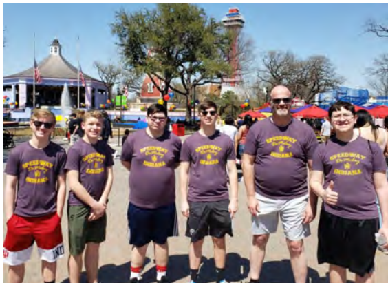
Speedway DeMolay Facebook

Members of Speedway DeMolay enjoyed visiting Six Flags over Texas after competing in the Frank Marshall Champions Tournament.