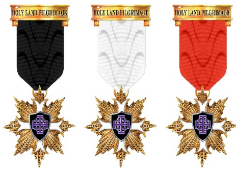
HOLYLAND PILGRIMAGE BARS

In order to promote certain advantages for the welfare of the Grand Commandery in general, the Constituent Commanderies and Sir Knights in particular, there is hereby submitted to this Grand Commandery Conclave a proposal to establish a "HOLY LAND PILGRIMAGE JEWEL" for the Grand Commandery of Indiana. (A) The Jewel should be presented only in consideration of loyal and financial support to the Holy Land Pilgrimage program. There is three level of support 1) $250.00 2) $500.00 3) $1000.00. For a donation of two hundred and fifty dollars the donor shall receive a jewel with a black ribbon. For a donation of five hundred dollars the donor shall receive a jewel with a white ribbon. For a donation of one thousand dollars or more the donor shall receive a jewel with a red ribbon. The donation will be accumulative totals. In lieu of jewel the donor may wear the bar. See below