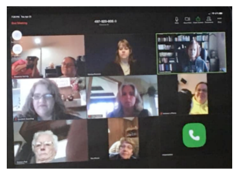
Social Order of the Beauceant #90 is having weekly Zoom meetings, just to say hi.