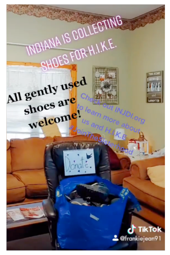
Job's is collecting shoes for HIKE.