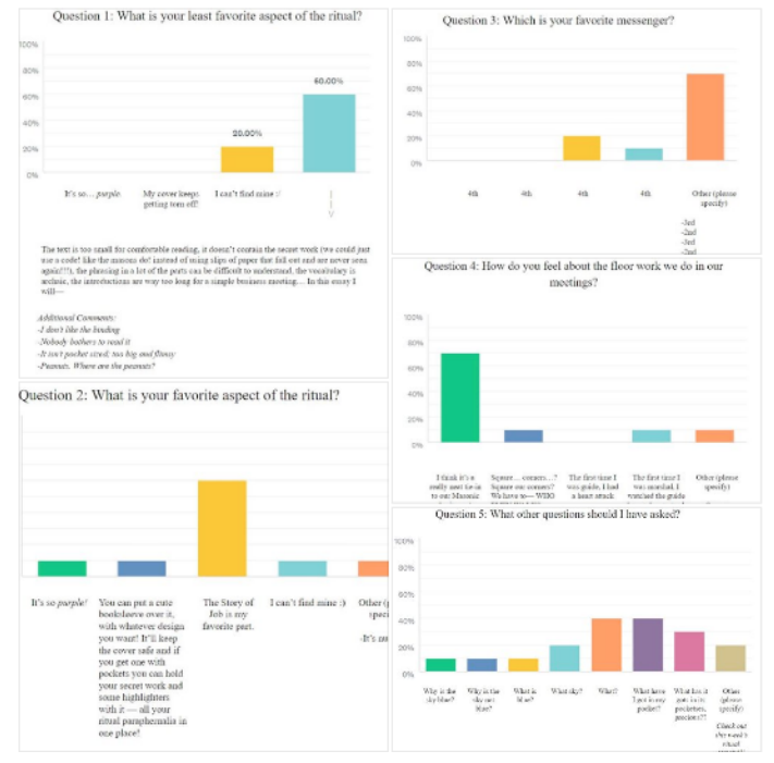
Job's has had fun surveys for its members.