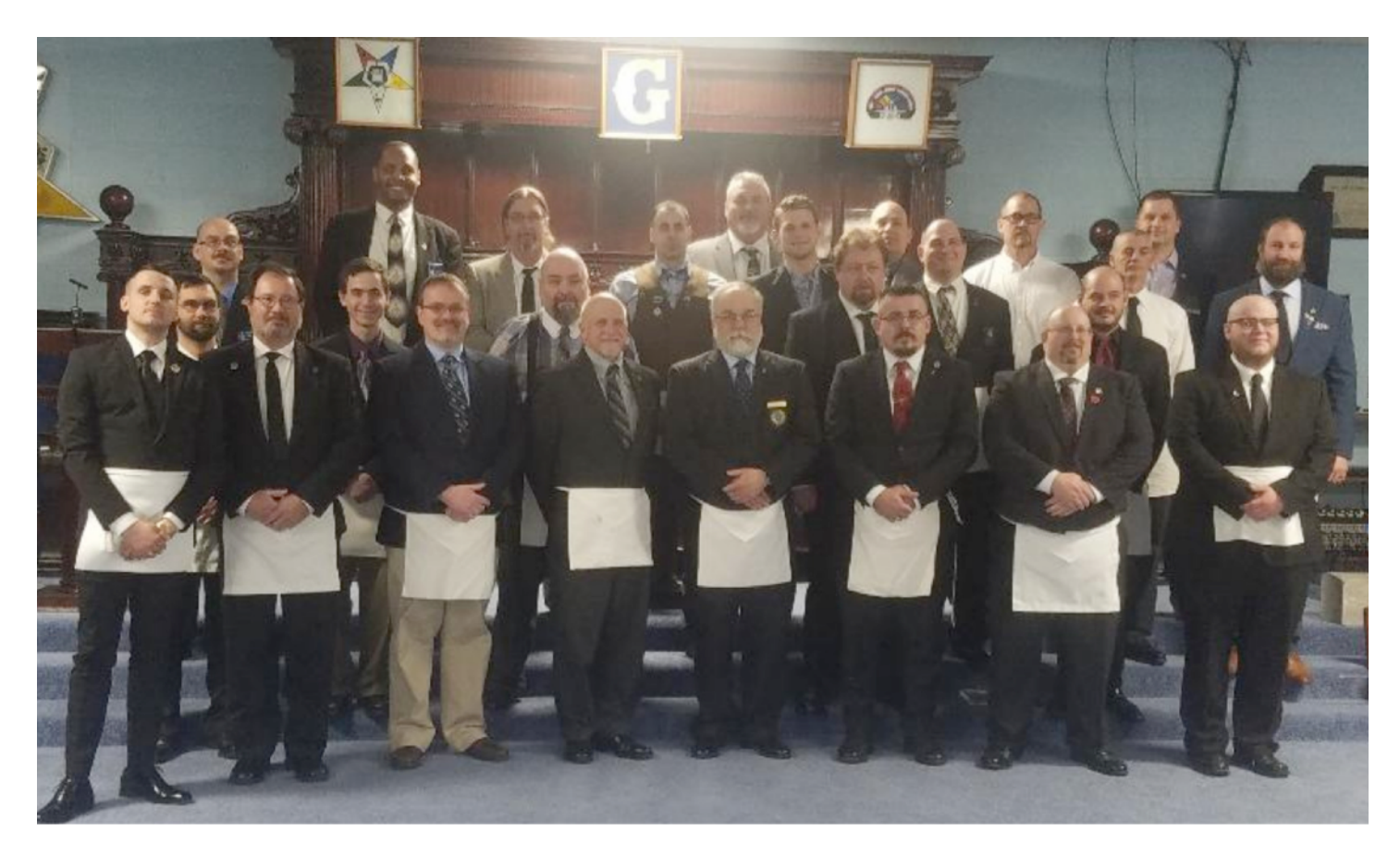
TriState Chapter Council Degrees were held in Michigan City and had 23 candidates.

Supporting and celebrating the accomplishments of others