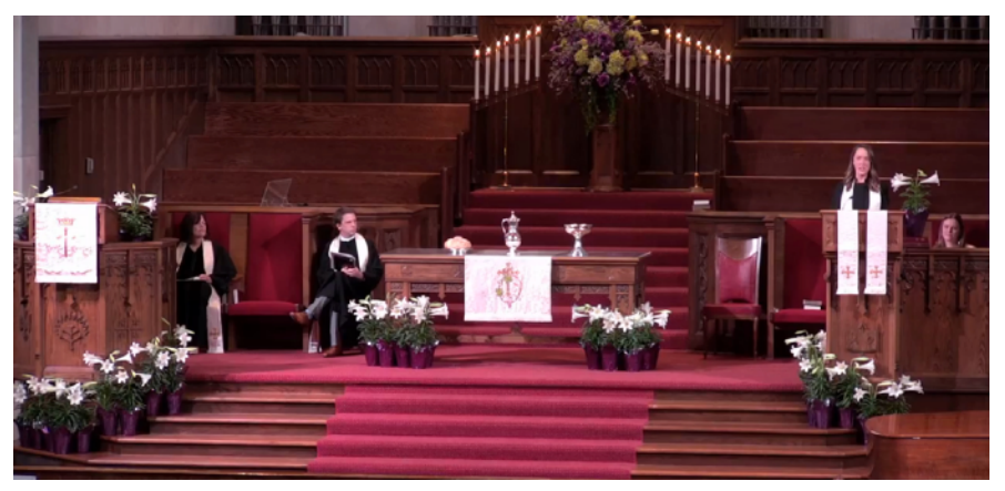
Prather York Rite attended virtual Easter Services at Second Presbyterian Church.

It's been about 6 weeks since the Stay at Home order was issued, 6 weeks since Masonic meetings were last held, and 6 weeks since we've been able to gather in groups. We've see Grand Sessions for Indiana Grand Lodge, all three York Rite Bodies, Job's and many others rescheduled until later in the year. What have you been doing to stay in touch with each other?