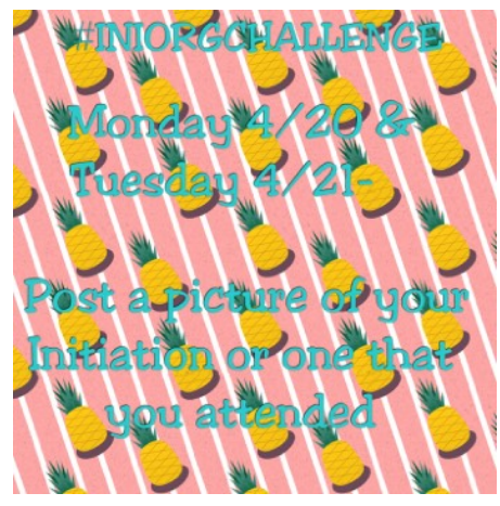
The Rainbow Girls are posting pictures of past events in an online challenge.