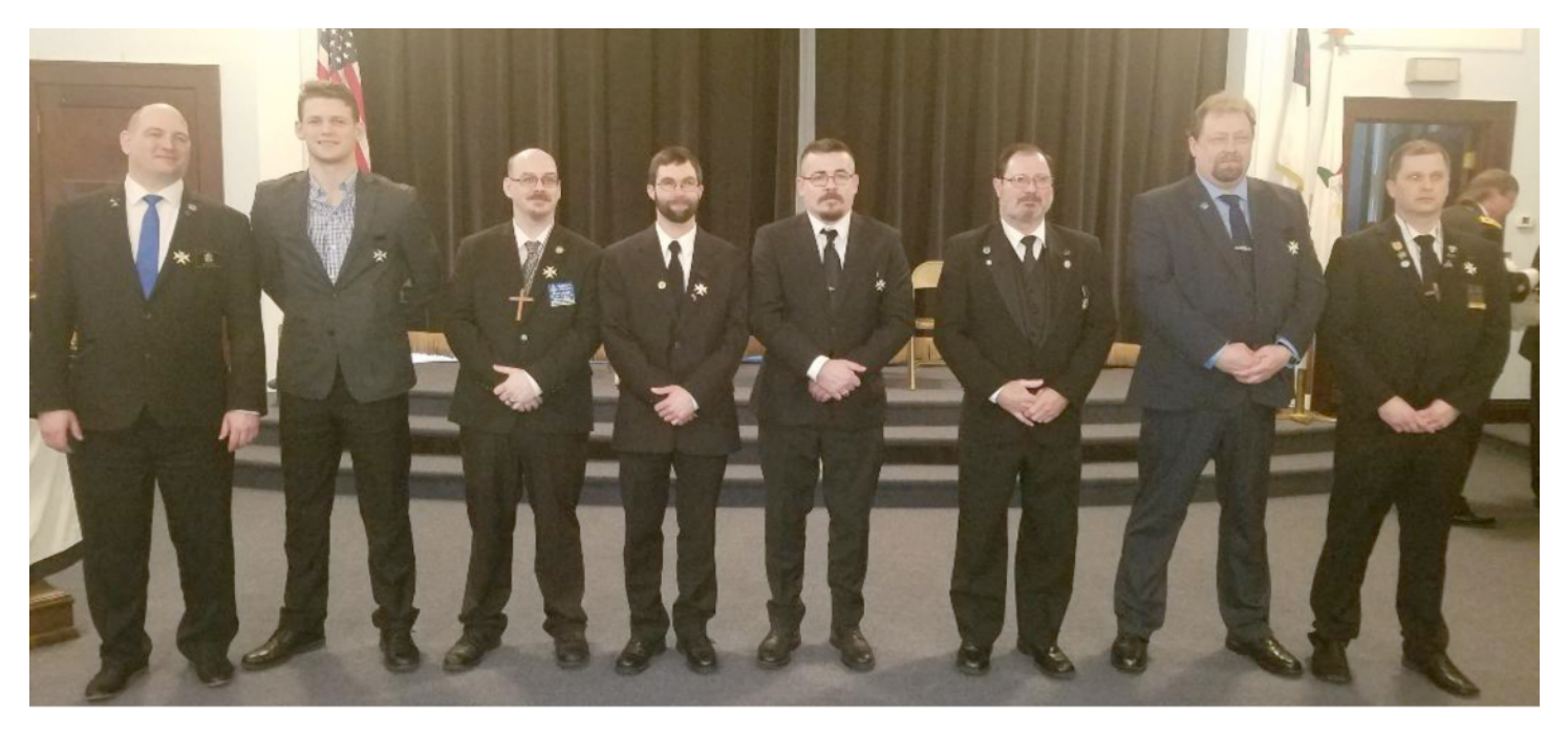
TriState Commandery Orders were held in Ohio with 12 candidates receiving the Orders.