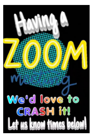
Job;s are visiting on Zoom and inviting other Bethel's to crash their party.