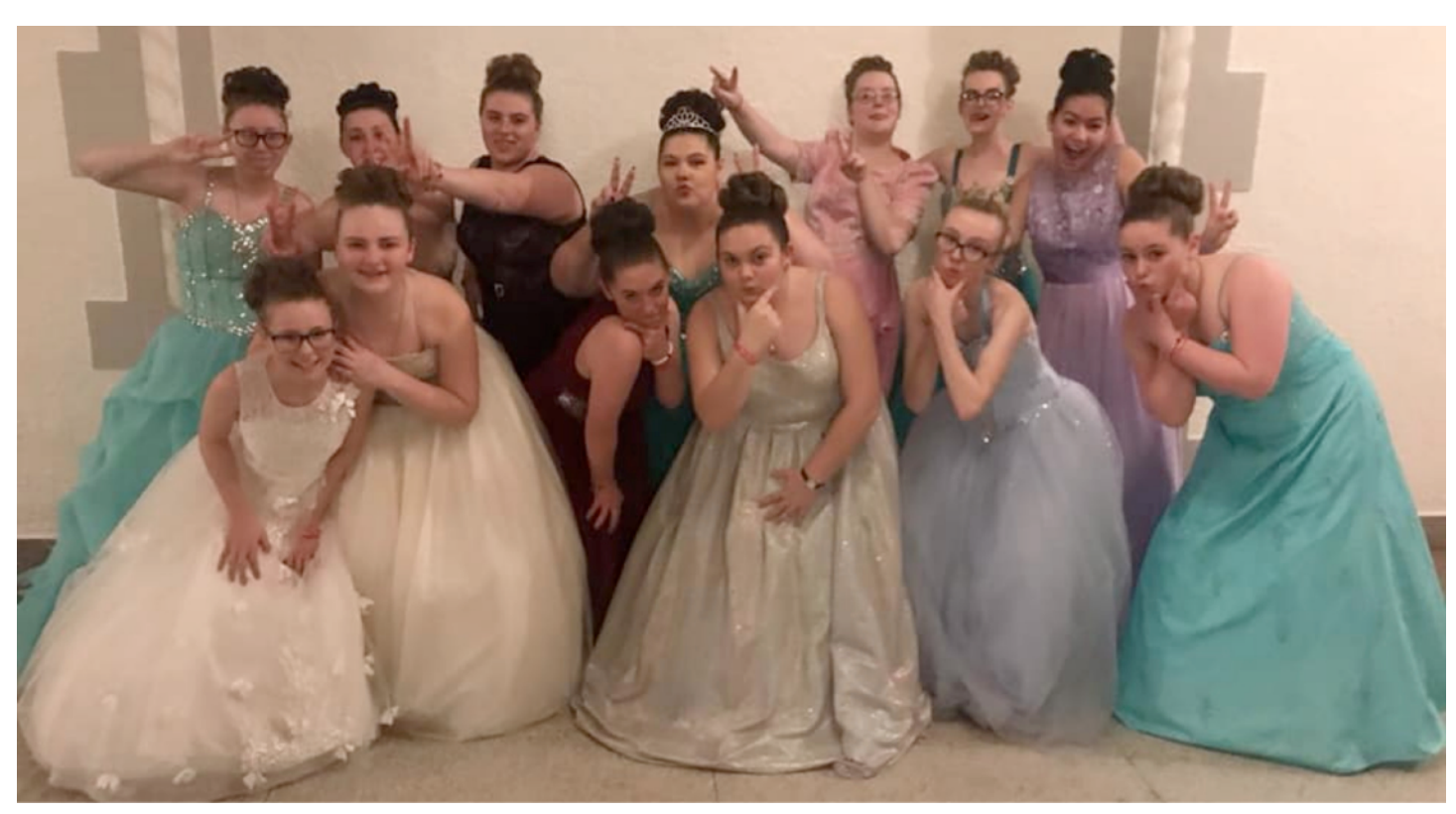
Page 10 of 22