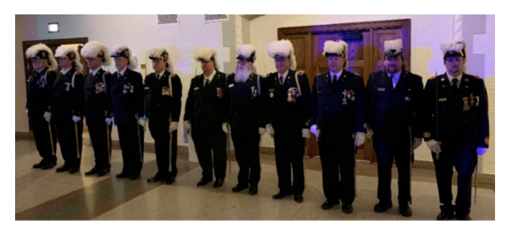
DeMolay Sweetheart Dance

On February 8th, 11 Sir Knights from 6 Commanderies formed the lines for the DeMolay Sweetheart Dance.