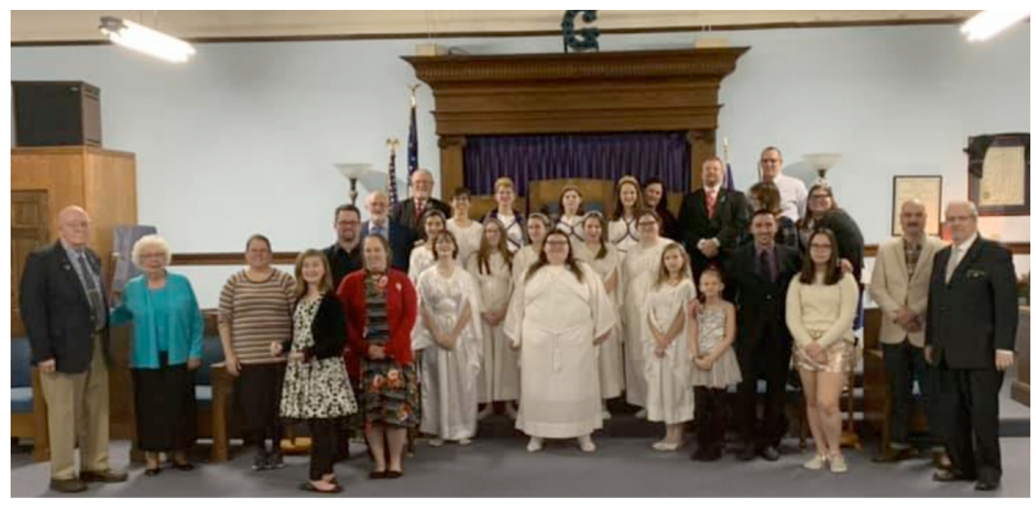
Bethel #44 came out of Reorganization and Initiated 3 new members. Congratulations girls!