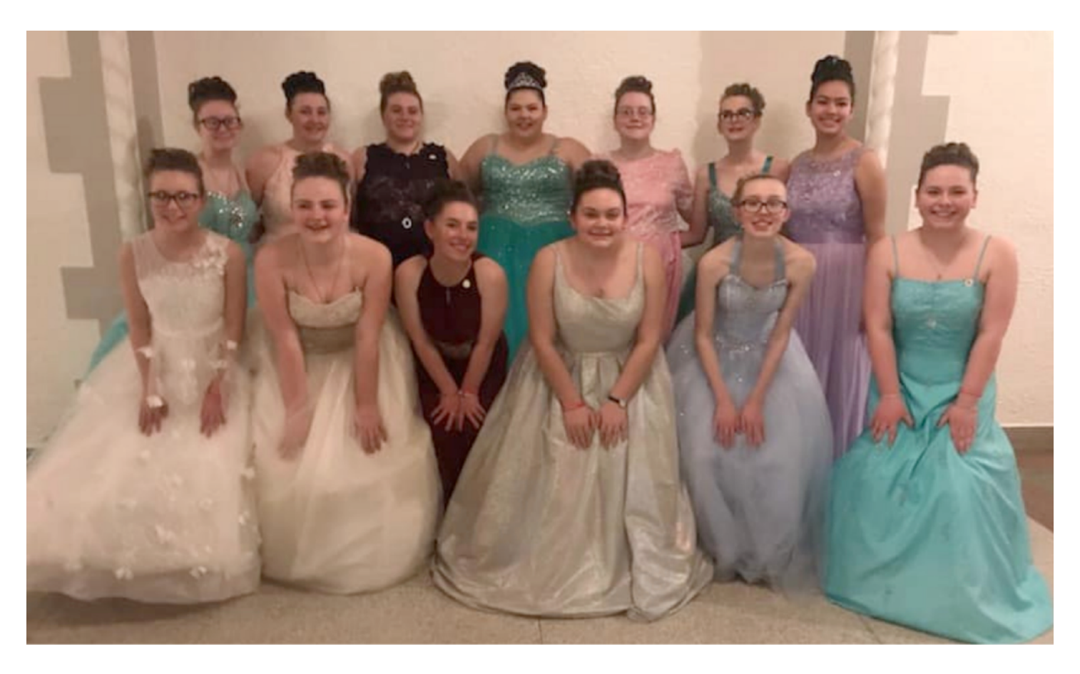
Having fun hanging out at the DeMolay Sweetheart Dance