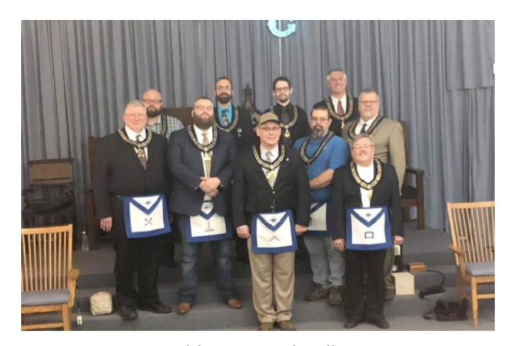
George Washington Lodge #325 F&AM