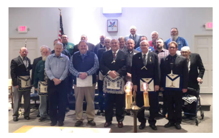
Webb Lodge #24 F&AM Whitewater Lodge #159 F&AM Richmond Lodge #196 F&AM Joint Installation