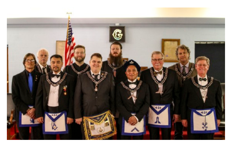
Carmel Lodge #421 F&AM