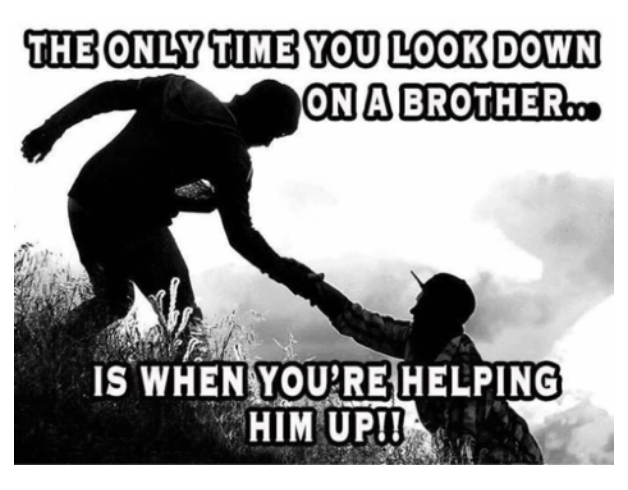
Page 21 of 24