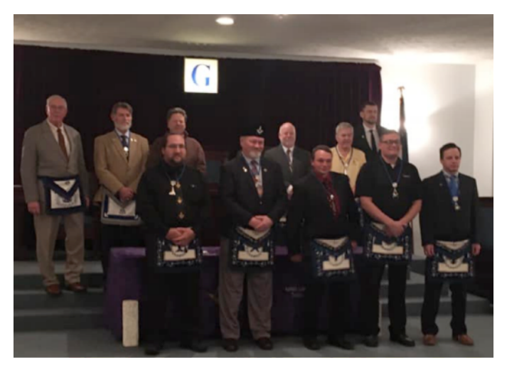
Austin Lodge #128 F&AM