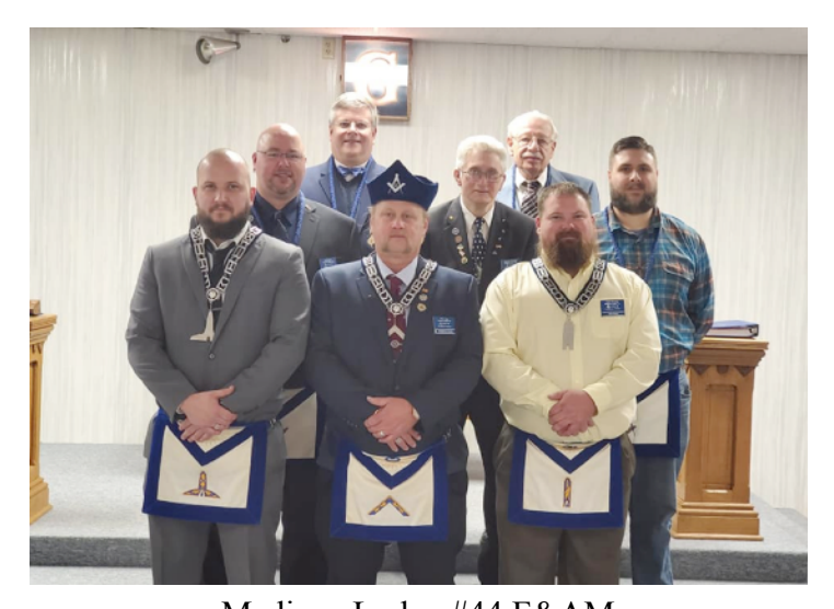
Madison Lodge #44 F&AM