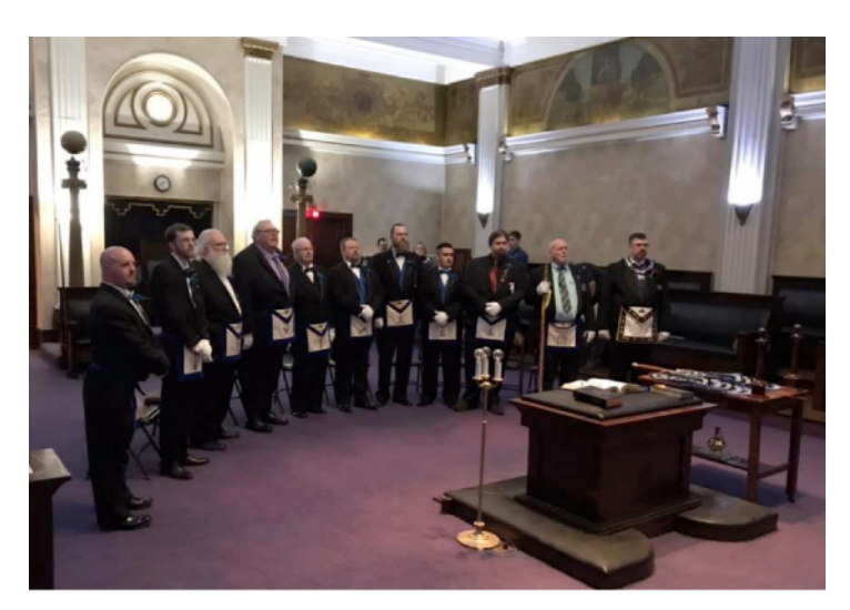
Whiting Lodge #613 F&AM