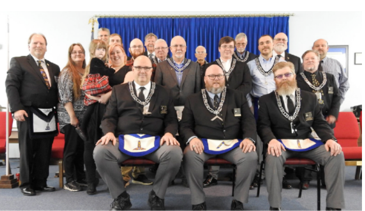
Jubilee Lodge #746 F&AM