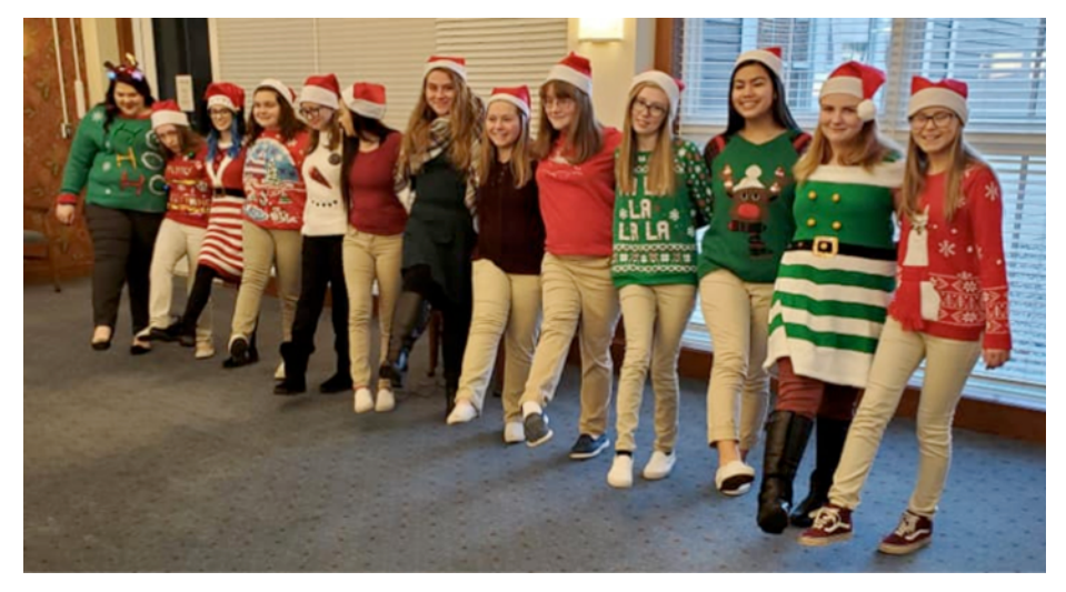
Indiana Rainbow Grand Officers annual Christmas visit at Compass Park-IMH on December 7th.