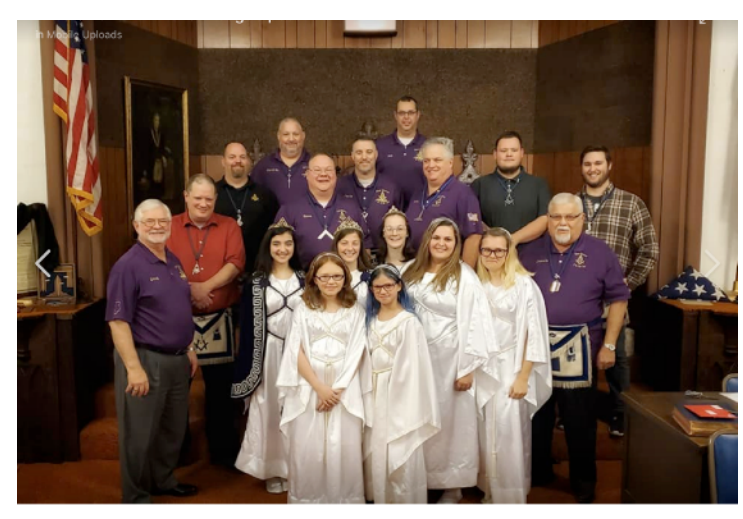
New Haven Lodge #740 F&AM