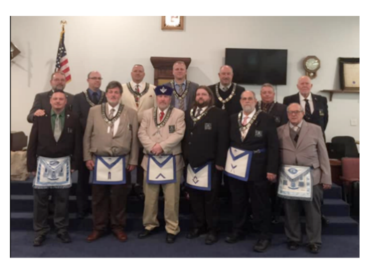
Greenwood Lodge #514 F&AM