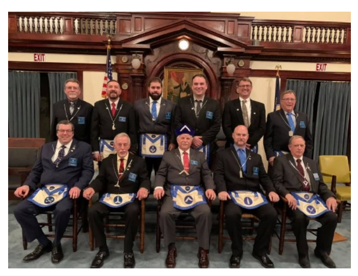
Noblesville Lodge #57 F&AM