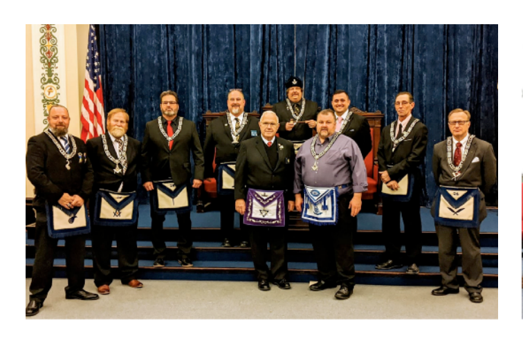
Shelby Lodge #28 F&AM