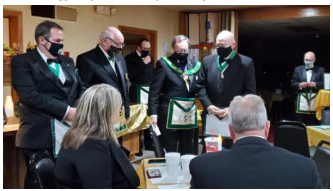
St. Bernard de Clairvaux Council

Supporting and celebrating the accomplishments of others