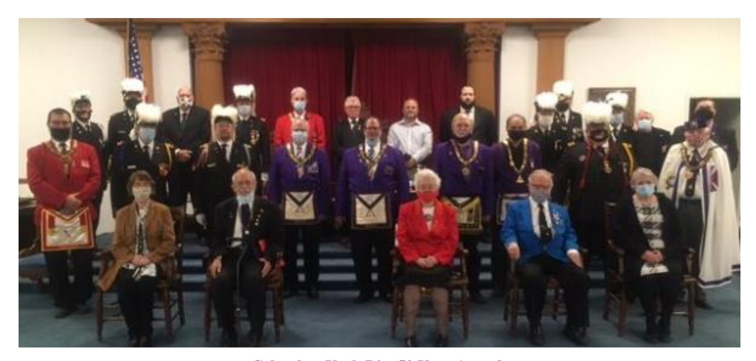
Columbus York Rite 50 Year Awards

On November 11<sup>th</sup>, Columbus Commandery held their Stated Conclave. They opened and placed it at ease, then invited the public into the lodge room. 50 Year Membership Awards were presented.