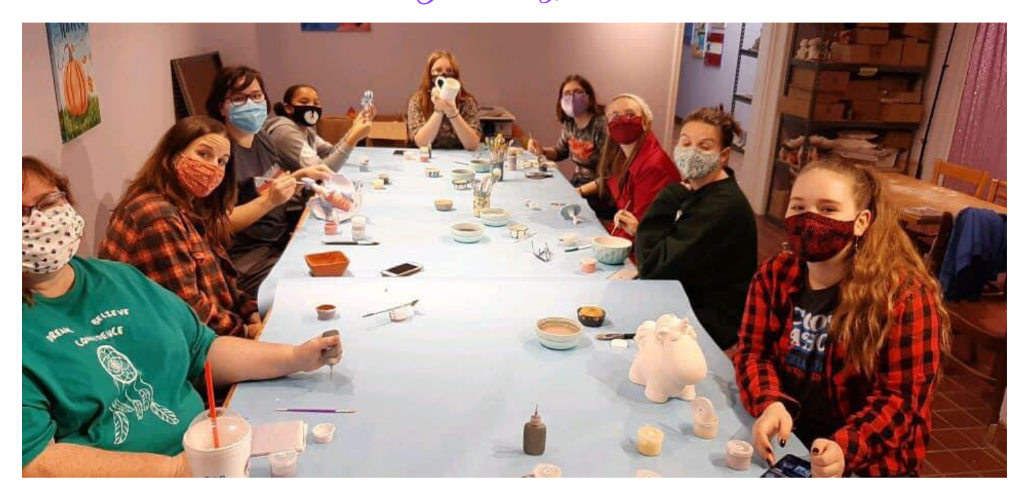
Bethel 34 had fun painting pottery!

Source: Indiana Job's Daughter's Facebook Page