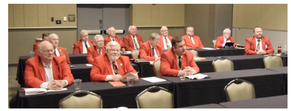
Page 10 of 19