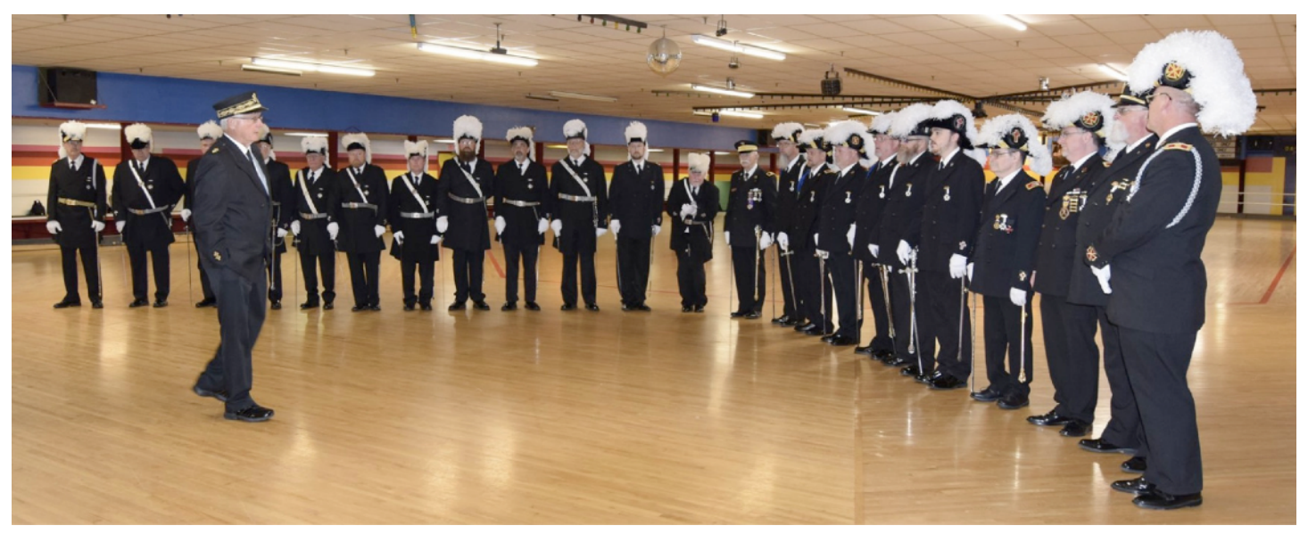
Drill Team Competition

The 2020 Drill Team Competition will be held at Grand Conclave. So far, three teams have begun to practice for the competition: Raper #1, Baldwin #2, and Greenfield #39.